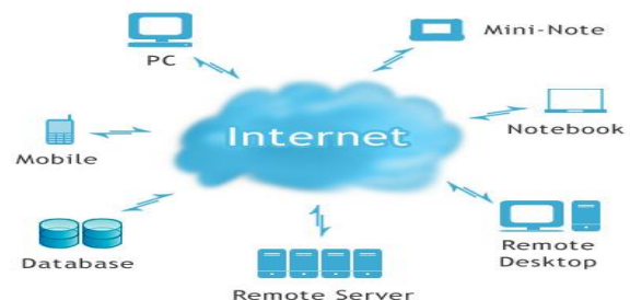
Fig. 1 Cloud Computing Technology [1]

Cloud computing has become a well-known expression since 2007. There is no single consensual meaning for cloud computing because different developers and organizations describe it in different ways. That is said, cloud computing is commonly described as a variety of facilities which are provided by a group of low-cost servers or personal computers, generally called a cluster, via the Internet. The main part of the cloud computing system is this cluster system, called the Cloud.