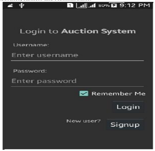
Fig 3.1 Login page for the user register

don't need to go other states and areas. It is a made the deal method direct. The customers of the structure will be industries, farmers and Administrator.