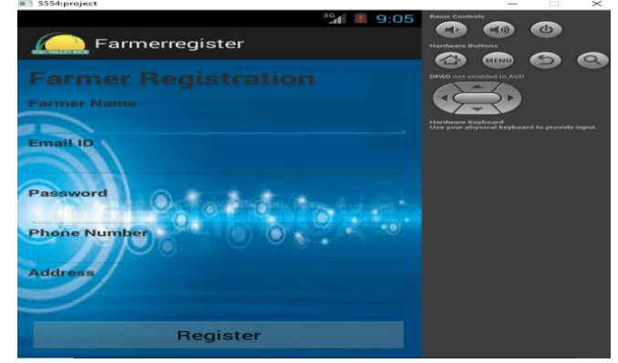
Fig 3.2 Register page:

An Android Application for farmers to disperse agribusiness information is to familiarize this system is to give the blooms, verdant sustenance's nuances information (such as soil, compost, methodology for gathering, etc.) to the farmer in voice structure, free of cost, at whatever point, wherever using Android propelled cell phone without web get to.