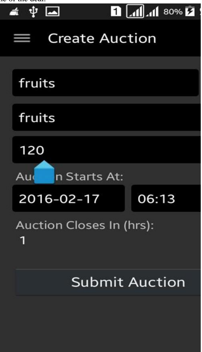
Fig 3.4 Farmer page while creating the auction

In this page, the vendor will add the thing information data wherein if needs to sell or closeout the thing through on the web. In this pages the shipper can be post of the image of the thing by the catch picture and each and every the basic inform about the thing, for instance, the thing name of farmer, its delineation and the closeout on the date and the time at what the thing will be emptied ultimately the stop time of the deal.