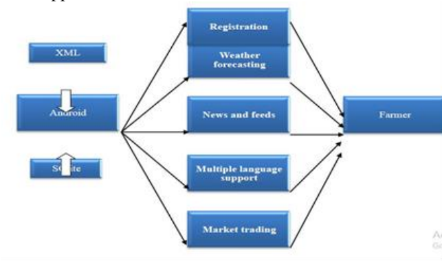
Fig 3.1.1 Structure of APPs.

Use case diagram for a modern farming techniques using android application