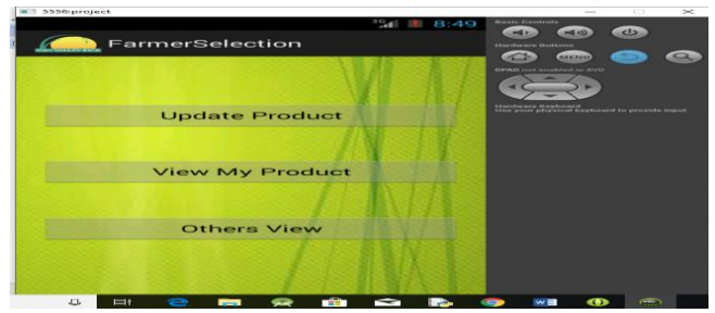
Fig 3.3 List view of items:

In the course list points of view on all in all errand. The greeting page involves the login page. The make closeout will made by the dealer when the will farmers posting the things for emptying.