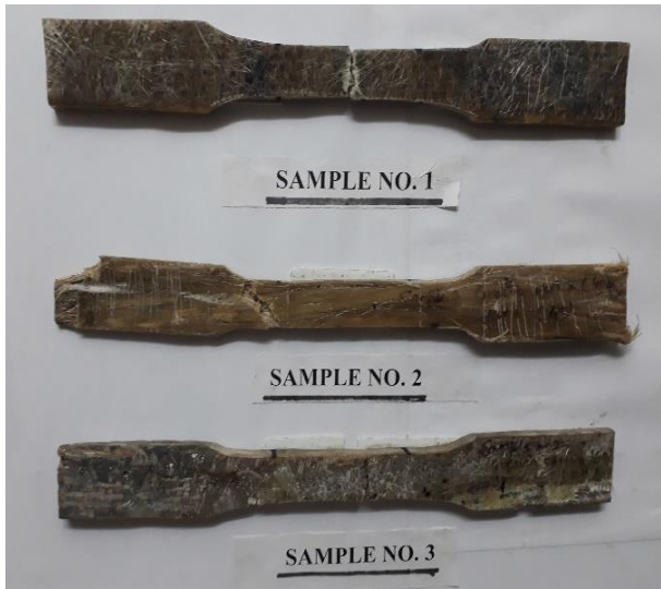
Figure 2: specimen of Grewia optiva and jute fiber reinforced composite

Specimen consisting triple layers of bhimal (Grewia Optiva) fiber and two layers of jute fibers. In the presence of sunlight, the extracted fibers of bhimal (Grewia Optiva) and jute are dried. first place the layer of bhimal (Grewia Optiva) fiber, and fill the epoxy resin over the bhimal (Grewia Optiva) fiber after it fill the jute fiber over the resin. before the resin get dried again fill the subsequent layers. By using the rolling press, the air gaps formed during developing specimen are easily removed before it dried.