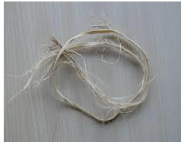
Figure 1: Grewia Optiva fiber

The ability of decomposition is the key point of plant fibers and they can give a well ecosystem. low cost and high performance of these composite accomplish the attention of industry economically.